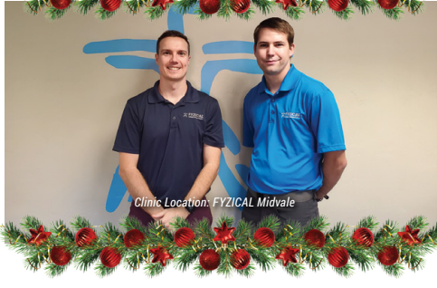
Clinic Location: FYZICAL Midvale