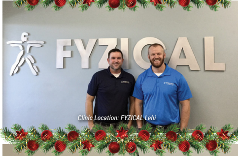
Clinic Location: FYZICAL Lehi