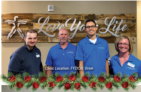
Clinic Location: FYZICAL Orem