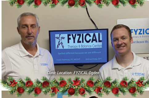
Clinic Location: FYZICAL Ogden